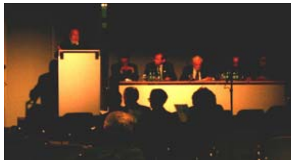
Fig.2: the 8 th WFSLMS in Munich